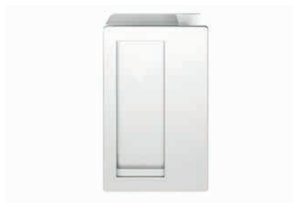
For double-glazed sliding door WITHOUT LOCK ( standard )