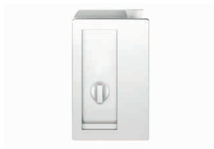
For double-glazed sliding door WITH THUMB TURN