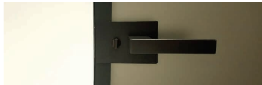
Plate supplied as standard in the same finish as the aluminium frame