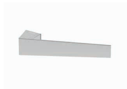
For double-glazed hinged door - ECLISE 40+one WITHOUT LOCK