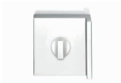
For single-glazed sliding door WITH THUMB TURN