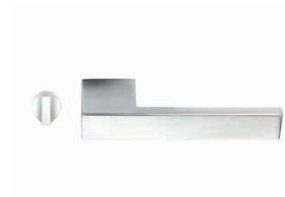
WITH THUMB TURN