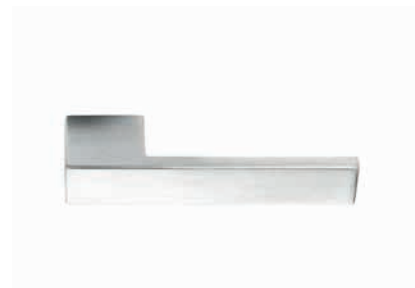
For single and double-glazed hinged door - ZANTE WITHOUT LOCK